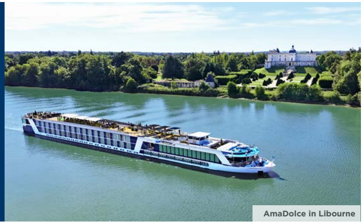
AmaDolce in Libourne

October 30-November 6, 2025 | AmaDolce 7-night river cruise roundtrip from Bordeaux