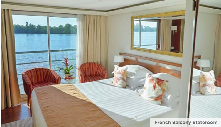
French Balcony Stateroom

October 30 - November 6, 2025 | 7-night river cruise | aboard AmaDolce